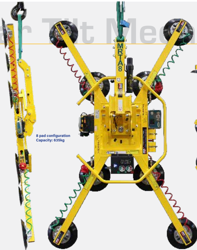
8 pad configuration Capacity: 635kg