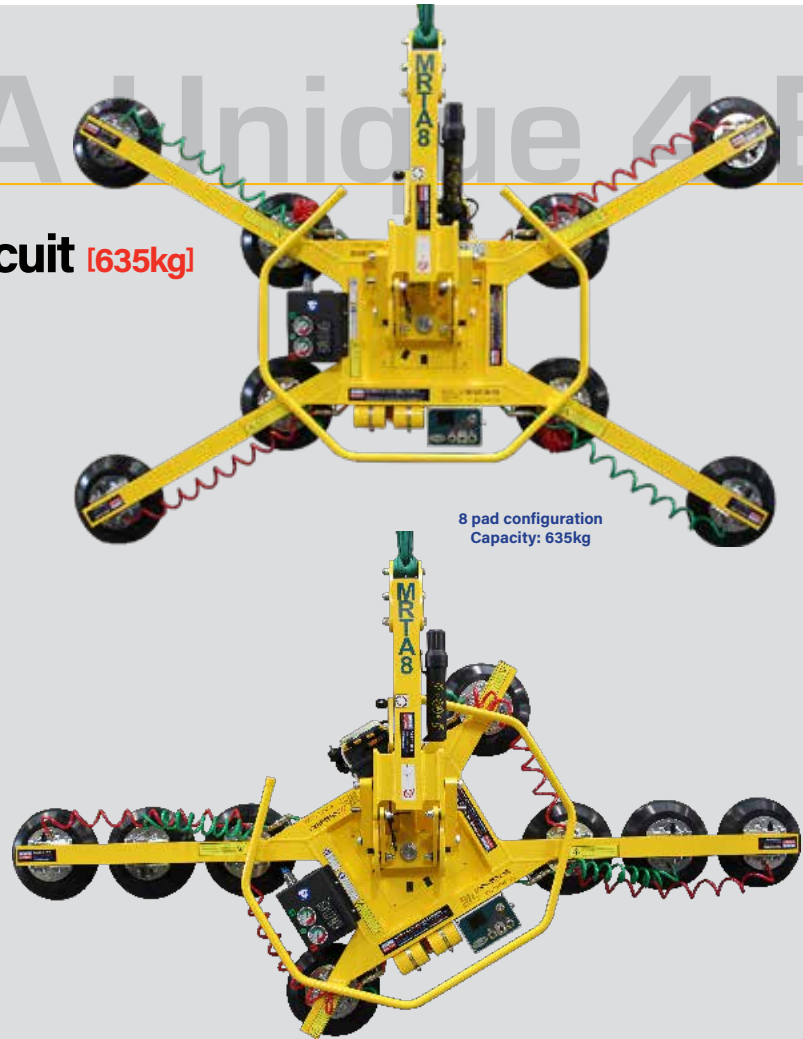
8 pad configuration Capacity: 635kg