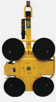
MRT4 - Compact Pad View