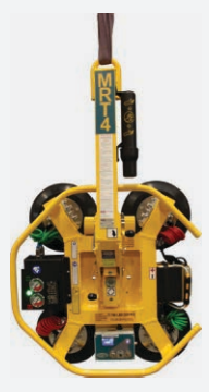
MRT4 - Compact

New and improved charging means the MRT4 Intelli-Grip lifter is more efficient.