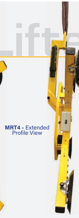
MRT4 - Extended Profile View