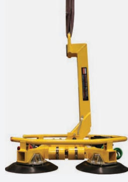
MRT4 - Compact Tilted View