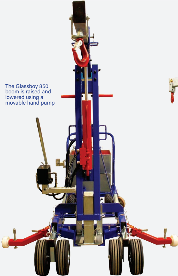
Glassboy 850 Long Wheel Base Configuration With Optional Rubber Tyres

The Glassboy 850 boom is raised and lowered using a movable hand pump