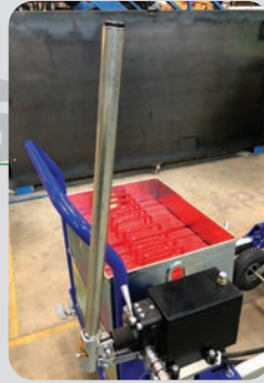
Features include a moveable hand pump.

It is a truly versatile counterbalanced floor crane thanks to its flexibility to assist in a broad range of applications.