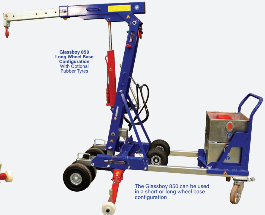
The Glassboy 850 can be used in a short or long wheel base configuration