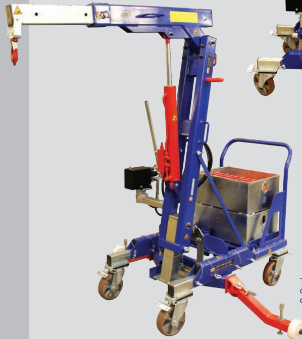
The Glassboy 850 features outriggers for stabilising during lifting