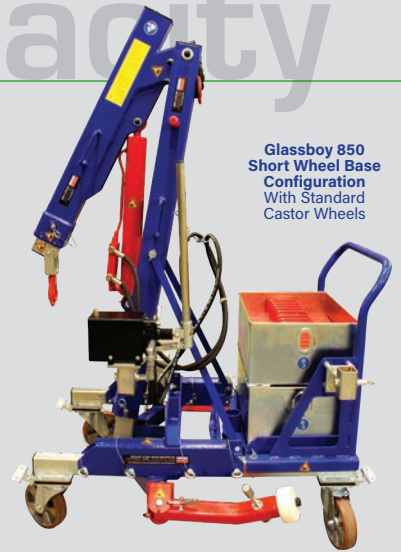
Glassboy 850 Short Wheel Base Configuration With Standard Castor Wheels