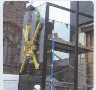
MRT4 with G20 Pick & Carry crane see page 245