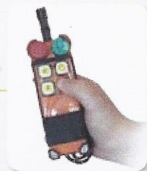
Optional radio remote control